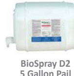
BioSpray D2 5 Gallon Pail