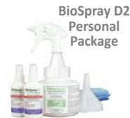
BioSpray D2 Personal Package