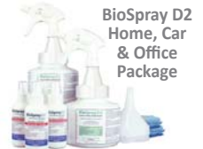
BioSpray D2 Home, Car & Office Package